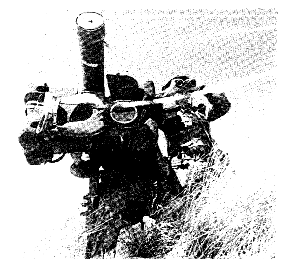
And as it is now — RBS 70 used for low local air defence with missiles, at about $90,000 a throw.