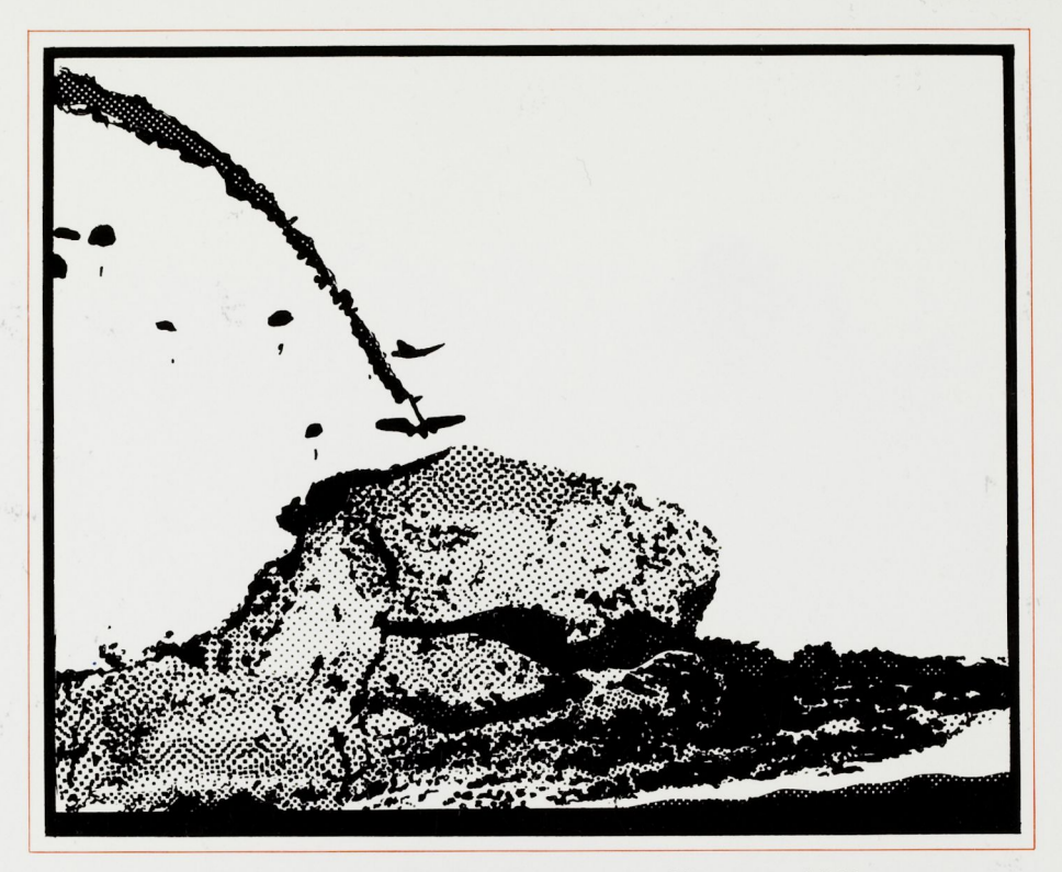
Paratroop Ju 52 shot down over Heraklion, Crete, 20th May, 1940.