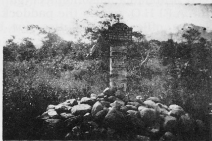
In memory of the Officers, N.C.O.s and men of the 7th and 18th Aust. Infantry Brigades who gave their lives, defending Turnbull Field (no.3 Strip). This marks the westernmost point in the Japanese advance, Aug - Sept 1942. 65 unknown Japanese Marines lie buried here.