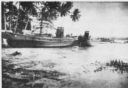
Captured Japanese landing craft and Milne Bay.