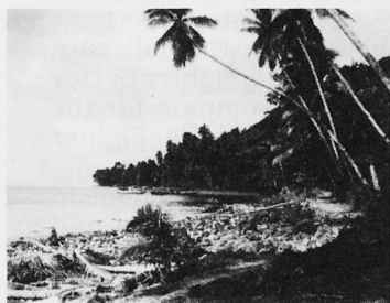
Milne Bay coastline with anchored trading ketches.

The Battery took over the A.A. defence of No.3 Strip where only a few weeks before the Japanese had suffered severe casualties. The Strip was now open to aircraft; the first plane to land, on 18th October, was a Flying Fortress.